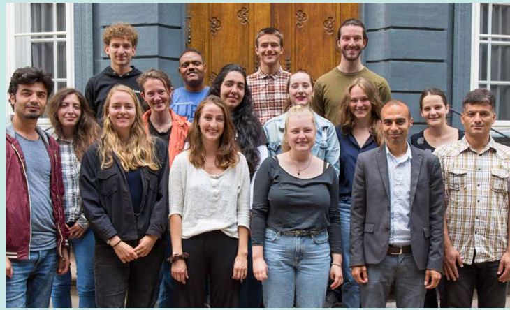
Students help refugees: the “Offener Hörsaal” team.

AlumniBasel members can now buy discounted tickets to selected concerts at the Lucerne Festival, which takes place by Lake Lucerne. The AlumniNews newsletter provides details of relevant events in the concert hall at the Lucerne Culture and Congress Centre (KKL) and how to buy tickets. Founded in 1938, the Lucerne Festival is one of the most renowned classical music festivals and attracts famous artists and symphony orchestras from all around the world. ■